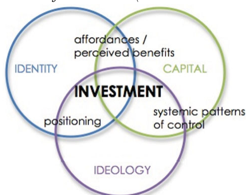
Figure 1 Model of Investment (Darvin & Norton, 2015, p.42)

Darvin and Norton's (2015) model of investment represents a significant theoretical development in applied linguistics, foregrounding the complex interplay of ideology, capital, and identity in shaping language teaching and learning. The model responds to calls for a more nuanced understanding of the sociopolitical dimensions of language practices (Block, 2007), arguing that individuals' participation in language learning is inseparable from broader structures of power and symbolic control (Bourdieu, 1987).